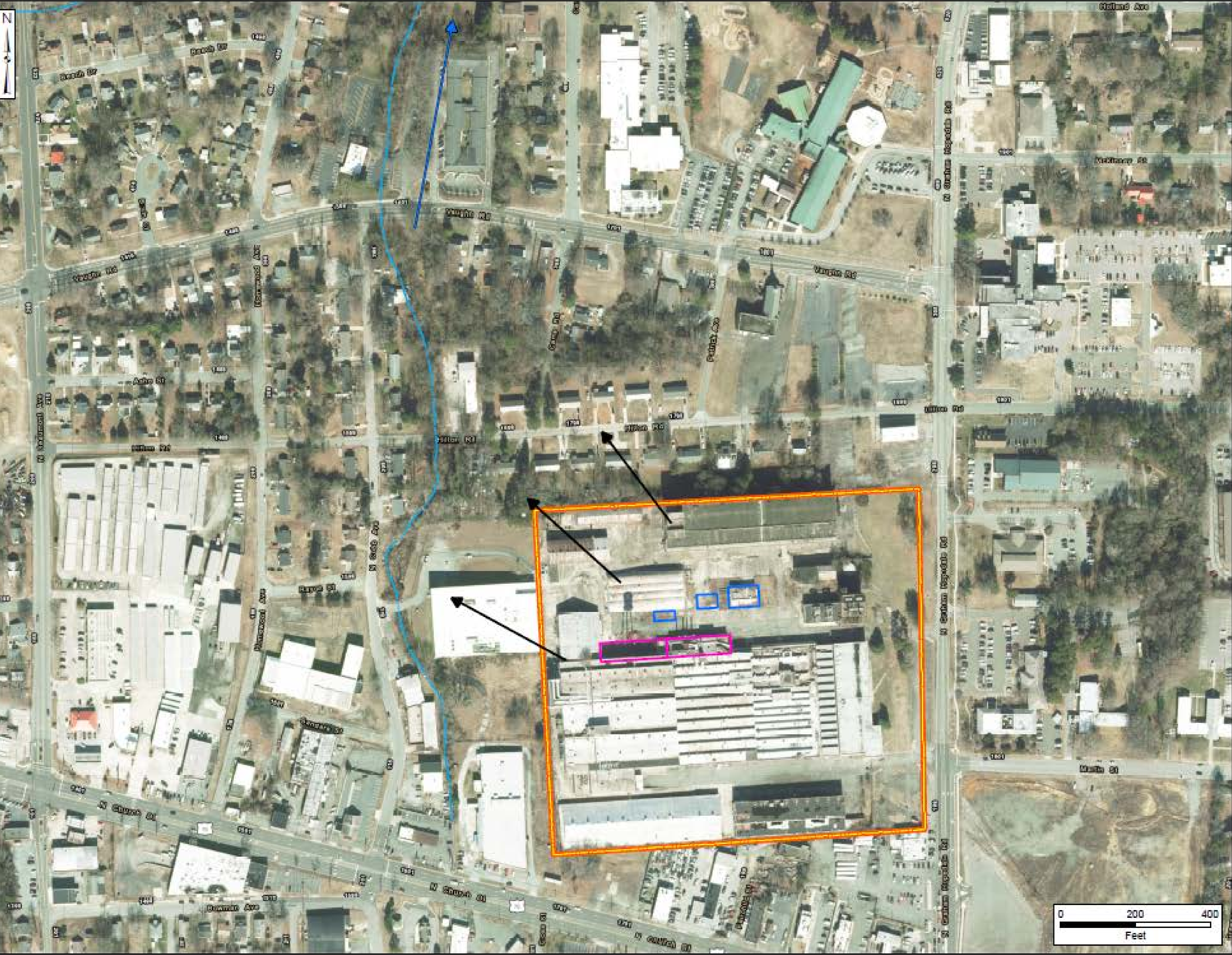
USAEC PFAS Preliminary Assessment / Site Inspection Former Tarheel Army Missile Plant, NC