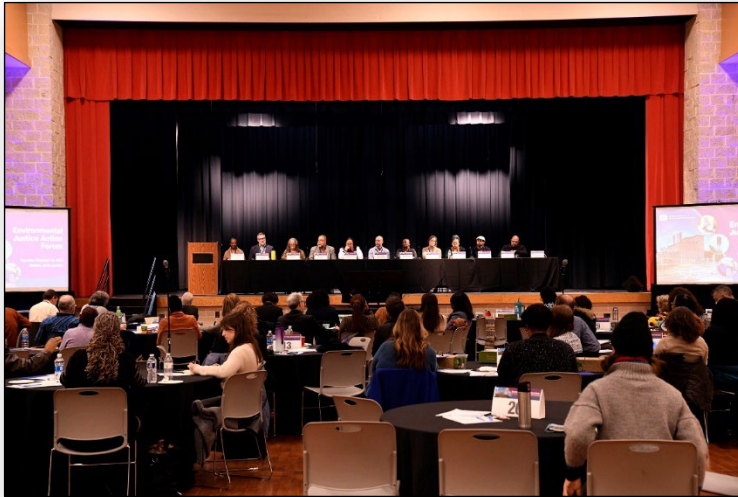
Environmental Justice Action Forum November 30, 2023