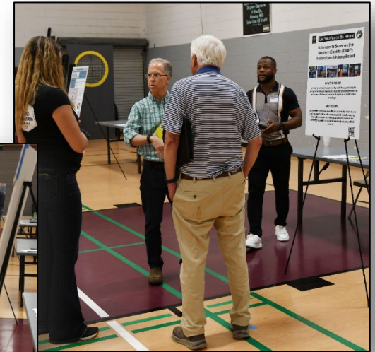
Community Open House June 27, 2024

https://burlingtonnc.gov/WesternElectric