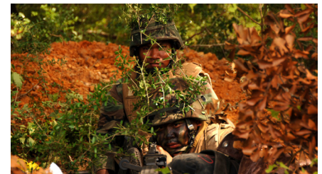
Camp Shelby offers a variety of training, including practice medical evacuations (top) and defensive operations in a tactical environment (bottom).